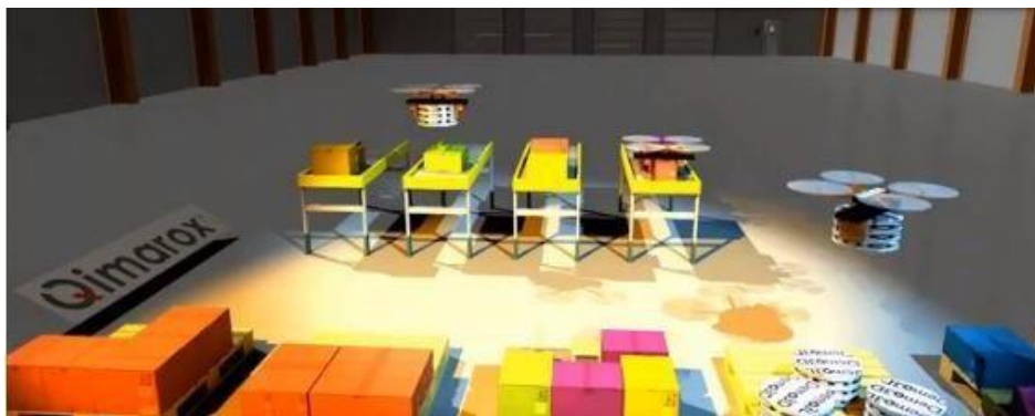
Figure 8.1: Snapshot of simulation video showing drones being used for palletizing

Small drone multi-rotor copters are beginning to be explored for use in material handling with the recent concept of drone delivery of small packages weighing up to approximately 2.2 kg (5 lb) [51]. This concept (see Figure 4) from the Netherlands requires minimal infrastructure to install, enables rapid deployment, and is expected to maintain a relatively high sustained throughput. Interest from companies like Amazon will continue to drive battery and control development [52].