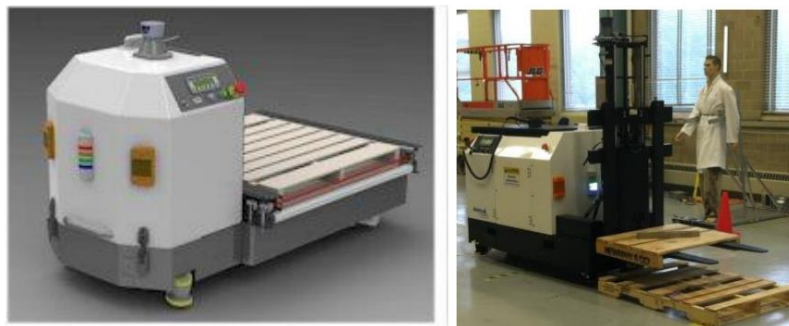
Fig 1.1: Typical AGV types (tugger and unit load AGV photos courtesy of America in Motion)

While there is no generally-accepted definition for the term “mobile robot,” it is often taken to mean a device that can move autonomously from place to place to achieve a set of goals (see, e.g., Tzafestas. Mobile robots are used in a wide range of applications including in factories (e.g., automated guided vehicles or AGVs), for military operations (e.g., unmanned ground reconnaissance vehicles), in healthcare (e.g., pharmaceutical delivery), for search and rescue, as security guards, and in homes (e.g., floor cleaning and lawn mowing). Automated guided vehicles or automatic guided vehicles (AGVs) were invented in 1953. AGVs are most often used in industrial applications to move materials around a manufacturing facility or a warehouse. Typical AGV types are, as shown in Figure 1.1, tuggers (AGVs that pull carts), unit loaders (AGVs with onboard roller tables for parts-tray transfers), and fork trucks (robots similar to manual fork trucks). Use of mobile robots, and AGVs in particular, is growing as the range of robot applications in factories, hospitals, office buildings, etc. increases. While mobile robots can use a range of locomotion techniques such as flying, swimming, crawling, walking, or rolling, this paper focuses mainly on rolling or wheeled mobile robots. More advanced mobile robots are briefly discussed and referenced in the sections on Localizing the Mobile Robot and Advanced Applications.